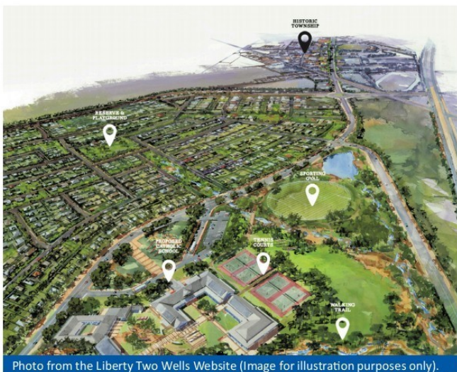
(Image for illustration purposes only).