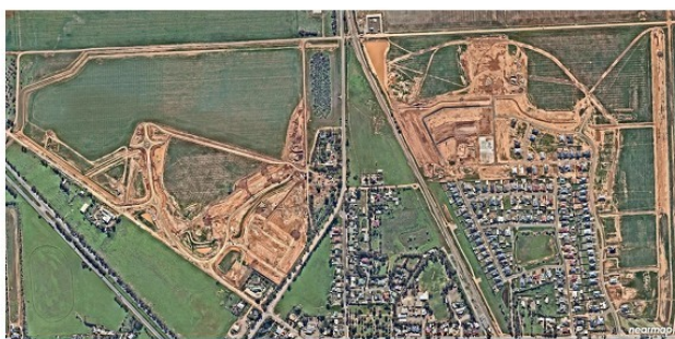
Hickinbotham's Liberty and Eden earthworks, to the north-west and north-east of Two Wells.

22 June 2019