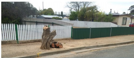
Repairs to kerbing has been undertaken on various properties in Rowe Crescent, Two Wells, where the trees had lifted the kerb in numerous places.