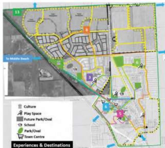
The proposed Experiences and Destinations Map, which shows some of the slated paths and loops as part of council's Walking and Cycling Plan.

To complete the survey or complete the submission form, head to apc.sa.gov.au