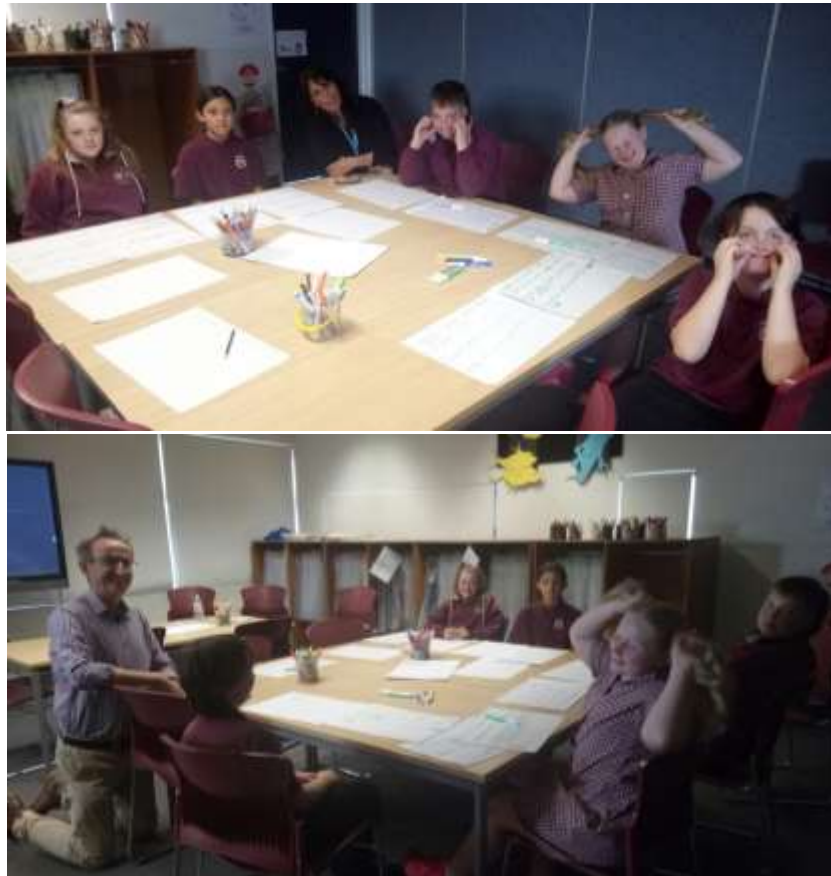
Some of the Students who participated (Permission granted for photos to be used publicly)

Students were advised their input will be considered as an input to consultation on the Walking Cycling Plan.