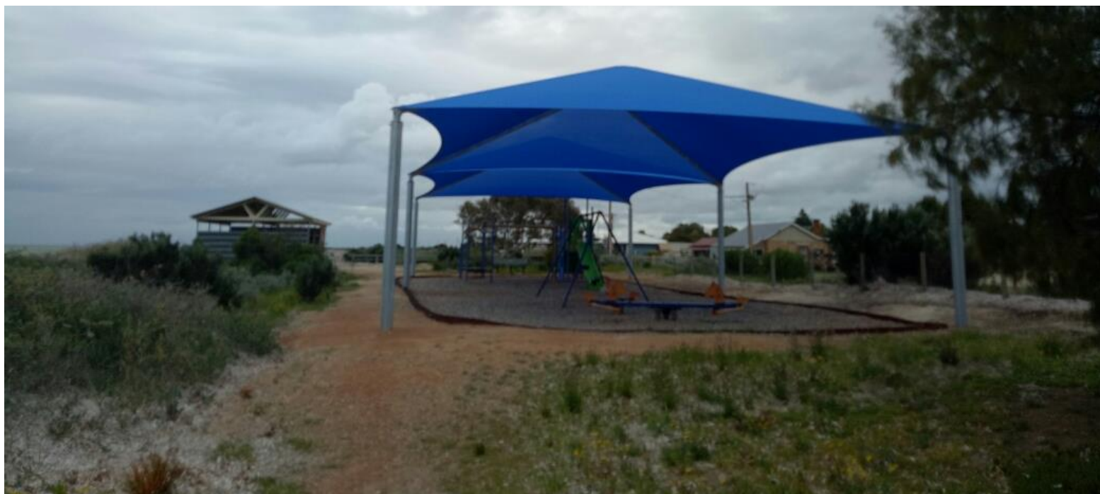
Figure 1 Playground early 2023

The foreshore precinct is a largely undeveloped public open space of 4,500m 2 . The foreshore contains shelter and barbeque, playground and shade shelter, toilet and a small number of low value plantings with limited maintenance.